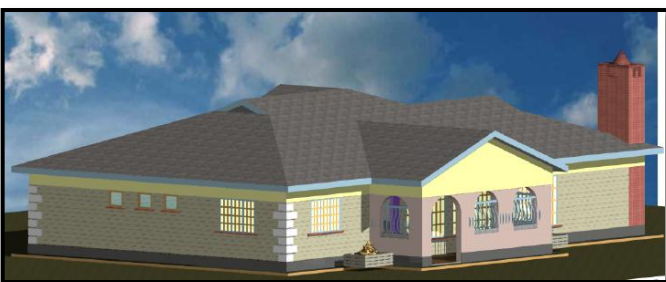
Architectures view of our children's homes

The vision for our land is a huge task for the years ahead of us so we are taking this journey one step at a time and with your continued support, we will reach our dream for the children of Kenya.