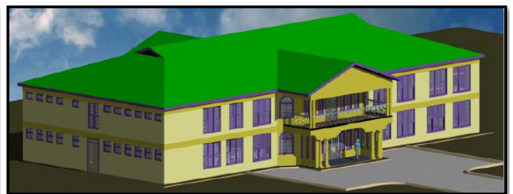
Architectures view of our community centre